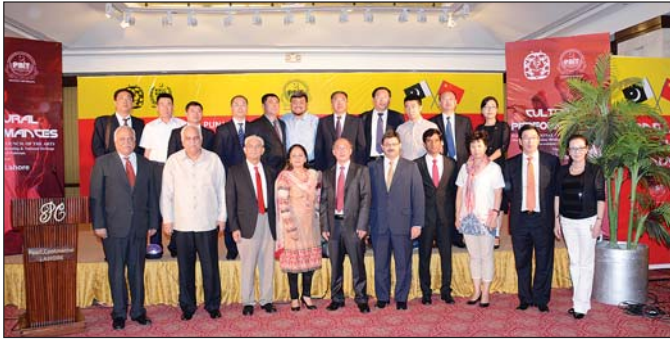
PBIT team, Minister for Finance, Minister for Industries and DCO Lahore with Yantai Delegation at the Cultural Dinner in Pearl Continental Hotel Lahore