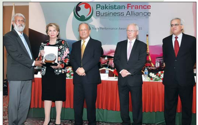
1 st PRIZE 2014/15 SIND MEDICAL STORES