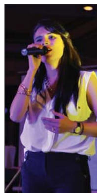
Vocalist Zoe Viccaji entertaining the audience.