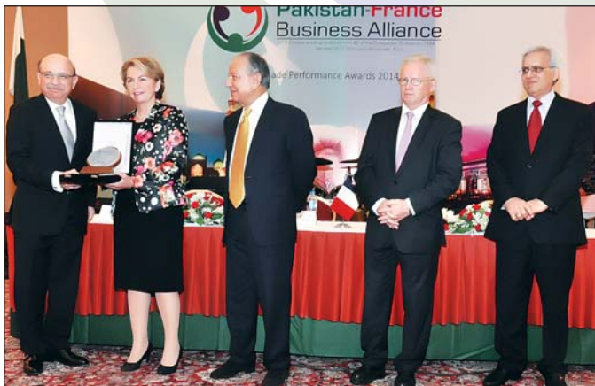
1 st PRIZE 2014/15 MAS ASSOCIATES (PVT) LTD