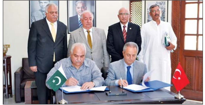
Minister for Industries signed the MoU with Economic Research Foundation Turkey at PBIT