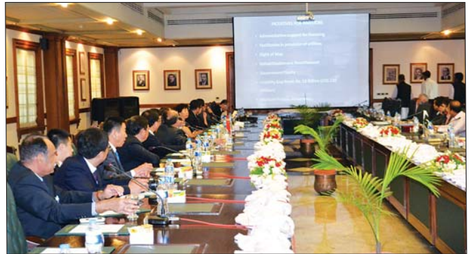
PBIT Organized Punjab-Yantai Business Forum at a Club