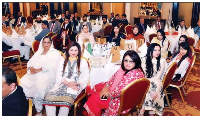
A view of the audience.