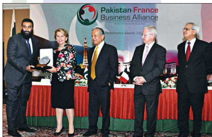
1 st PRIZE 2014/15 GIA EXPORT MARKETING SERVICE (PVT.) LTD.