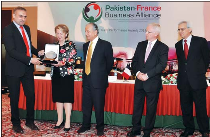
1 st PRIZE 2014/15 CMA CGM PAKISTAN