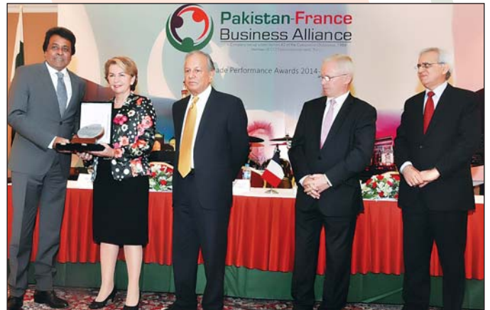
1 st PRIZE 2014/15 INFOTEL PAKISTAN (PVT) LIMITED.