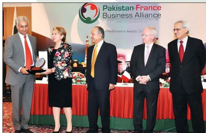
1 st PRIZE 2014/15 MARTIN DOW LIMITED