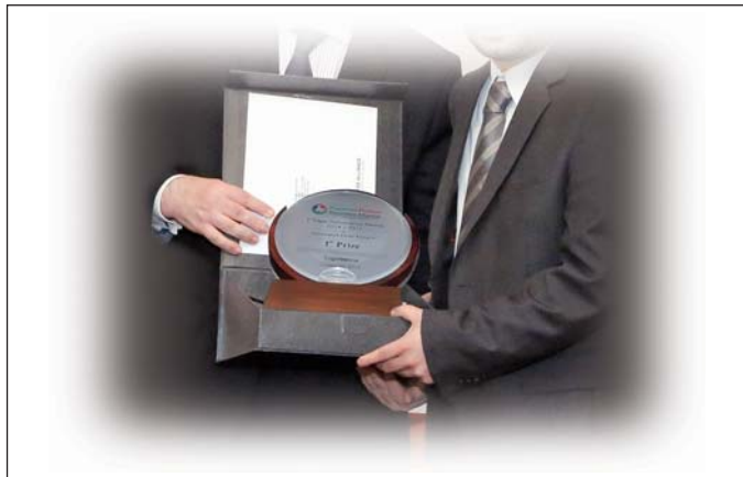
1 st PRIZE 2014/15 ATLAS EXPORTS (PVT) LTD