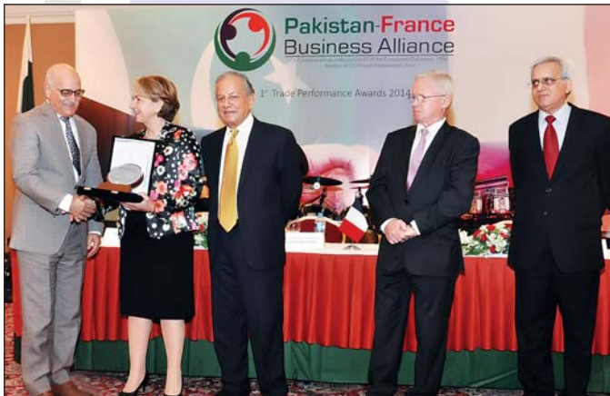
1 st PRIZE 2014/15 OBERTHUR TECHNOLOGIES PAKISTAN (PVT) LTD