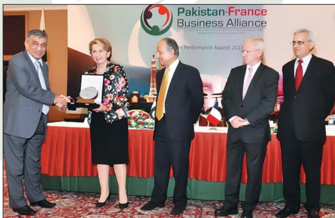
1 st PRIZE 2014/15 S.I. CHEMICALS