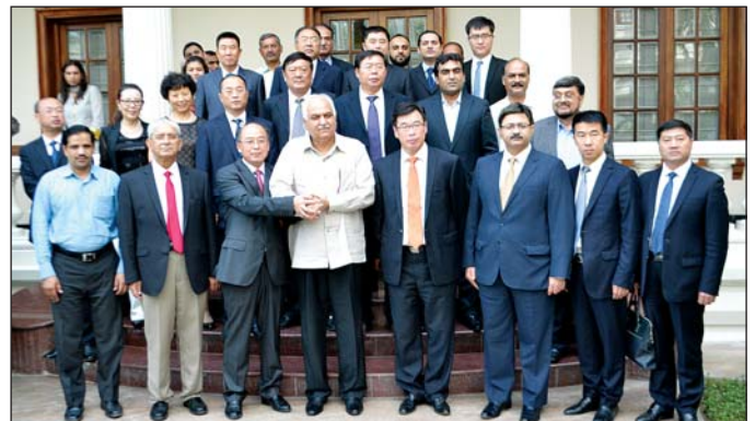
CEO PBIT, Chairman PBIT and Minister for Industries with the Yantai delegation from China