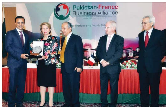
1 st PRIZE 2014/15 YUNUS TEXTILE MILLS (PVT) (YTML)