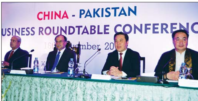
PBIT Organized Pak-China Roundtable Conference in Collaboration with KASB Corporation at Pearl Continental Hotel Lahore at