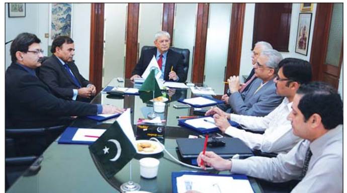
Ambassador of Pakistan to Kuwait visited PBIT and held a meeting with CEO PBIT, Chairman PBIT and Chairman of Pakistan Poultry Association Ambassador.