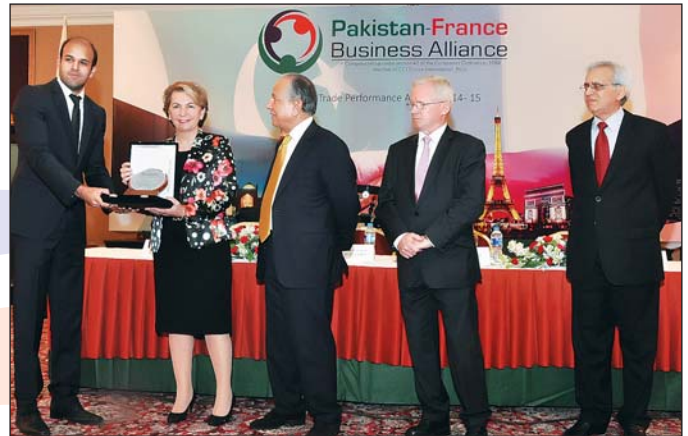
1 st PRIZE 2014/15 SAADAT INTERNATIONAL