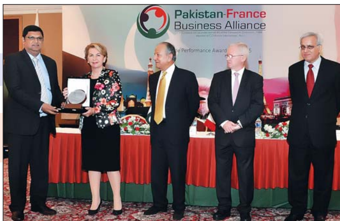
1 st PRIZE 2014/15 SIND MEDICAL STORES