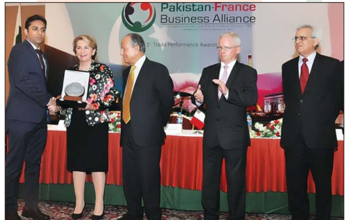
1 st PRIZE 2014/15 GHAZI BROTHERS