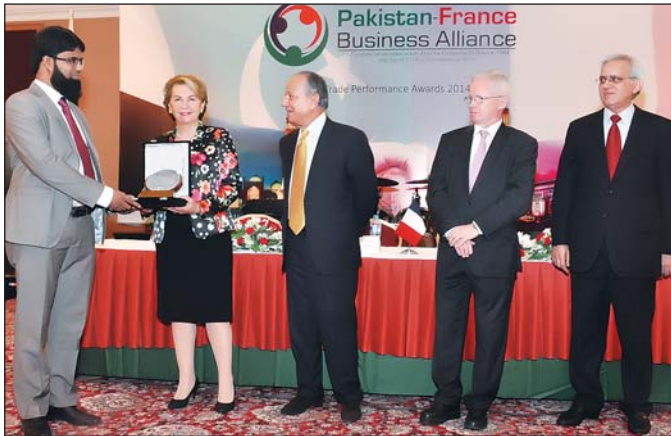
1 st PRIZE 2014/15 SIND MEDICAL STORES