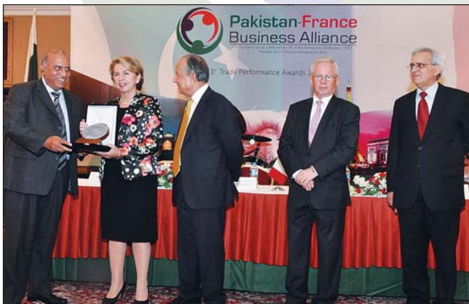
1 st PRIZE 2014/15 GRAND PARENT POULTRY