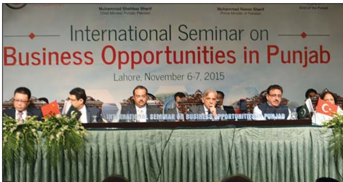
PBIT in collaboration with C.M Punjab Office Organized International Seminar on 06-07 November