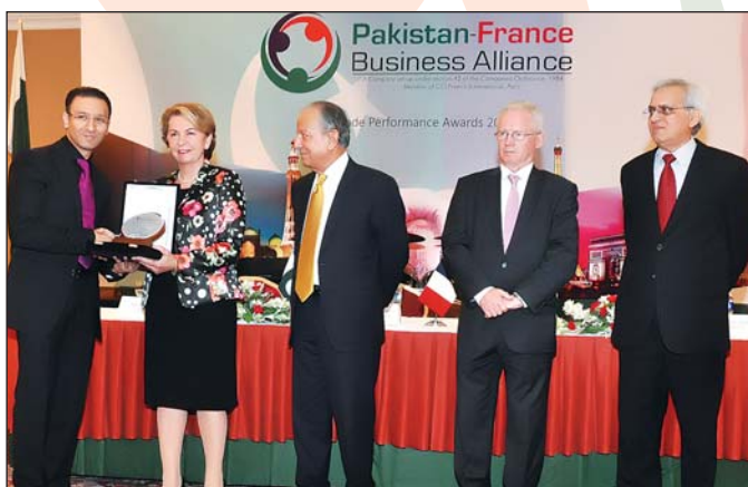
1 st PRIZE 2014/15 ELMED INSTRUMENTS