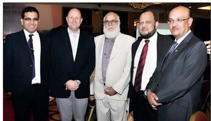
Members and guests.