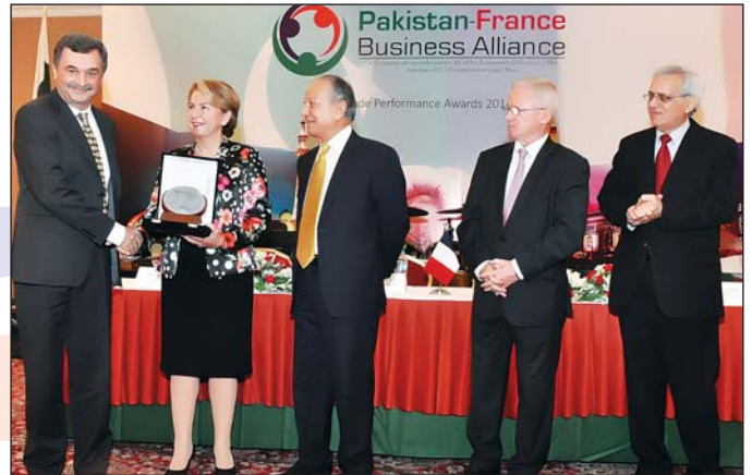
1 st PRIZE 2014/15 GREAVES PAKISTAN (PVT) LIMITED.