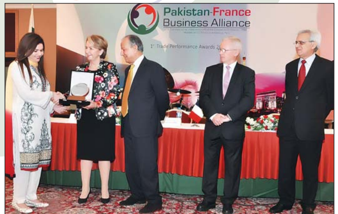
1 st PRIZE 2014/15 SIND MEDICAL STORES