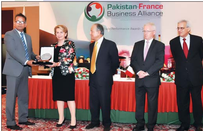
1 st PRIZE 2014/15 GLOBAL MARKETING SERVICES